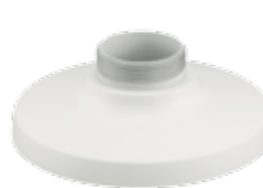
SBP-167HMW / SBP-167HM